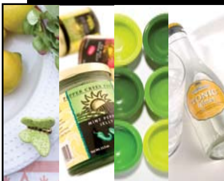
Fleming • Stirrings • Zak Designs • Pepper Creek Farms

Fancy Food & Culinary Products magazine will distribute magazines at 15 industry trade shows in 2010! This is the way to get your message into the hands of attendees at these shows and more: Winter and Summer Fancy Food Shows, Atlanta AmericasMart Winter and Summer Markets, International Home & Housewares Show, Gourmet Housewares Show, NCA Sweets & Snacks Expo, IDDBA Show, SCAA Show and World Tea Expo, New York Spring and Fall Tabletop Shows, PLMA's Private Label Trade Show, Winter and Fall Philadelphia National Candy Gift & Gourmet Shows